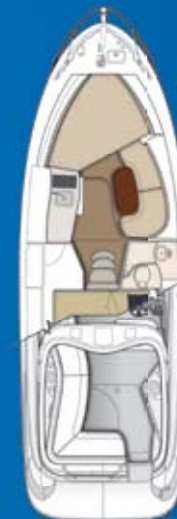
STANDARD FIXED BERTH

Possessing a style that looks great anywhere, the new Bayliner 320 also delivers hard-to-beat versatility. The cockpit features a wraparound lounge and an impressive entertainment center – both add real flexibility when entertaining. Below deck, you'll find superb natural light and your choice of layout options to fit whatever suits you best.