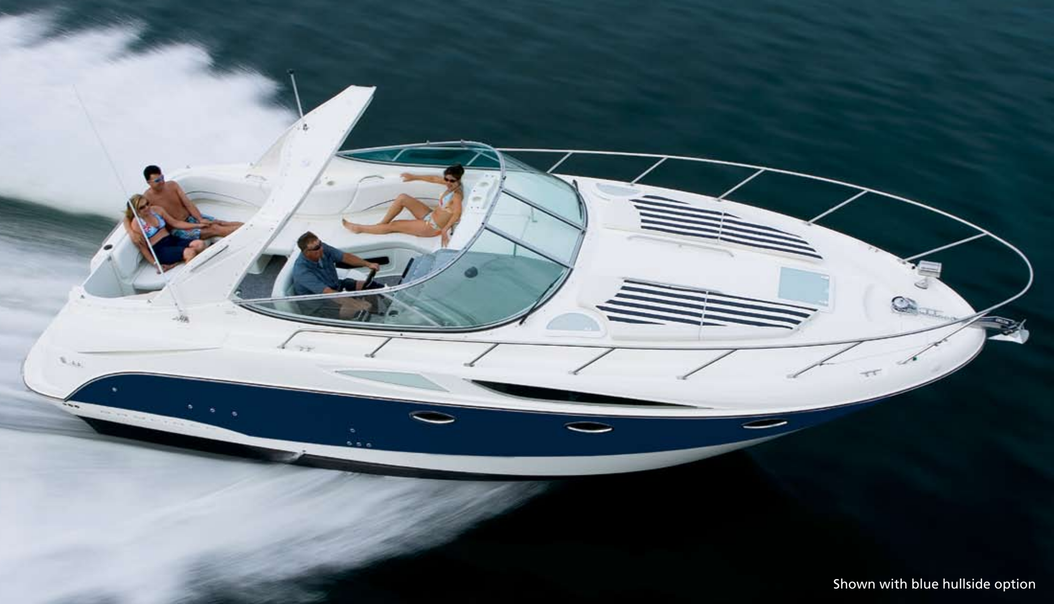
Shown with blue hullside option